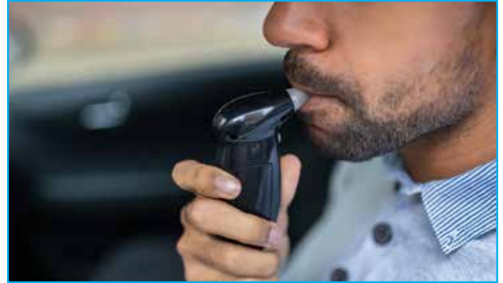
Breatheriser/Alcohol content detectors