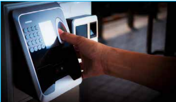
Biometric control/time & attendance (T&A) systems /Access control Units