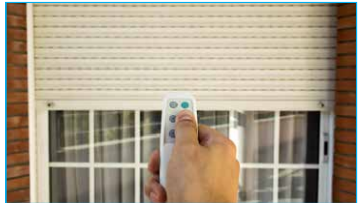
Electronic gates and Auto shutters.