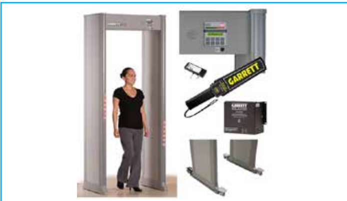
Metal detectors/Hand held Garrets and walk through Machines