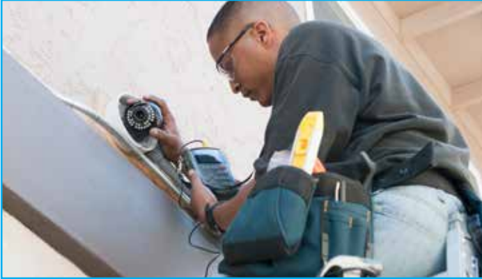
CCTV installation, Management & Maintenance