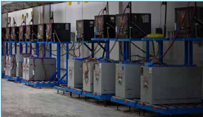
Electricity Backup systems i.e. solar, inverter, generators