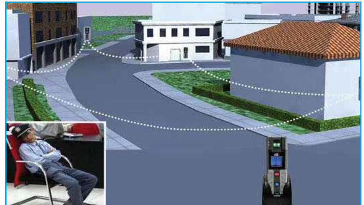
Guard Monitoring/Tour systems.