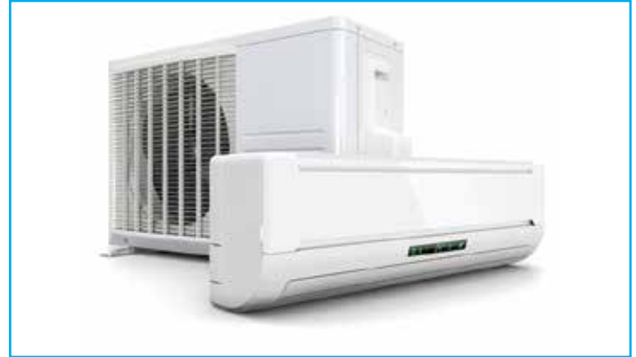
Space air conditioning and Maintenance of Air conditioner systems