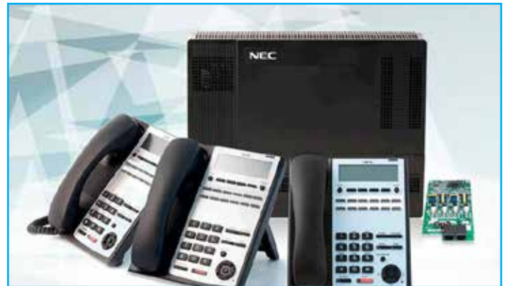
Intercom installation and Mentainance(PBX)