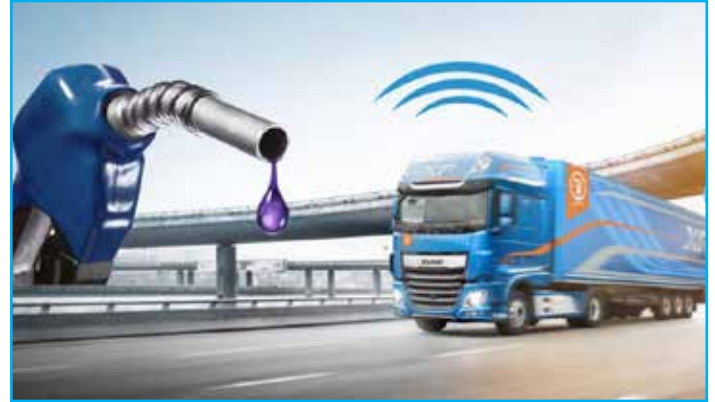
Vehicle/Fuel Tracking/Fleet Management tools