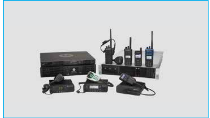
Radio systems/Radio calls, Walkie Talkies