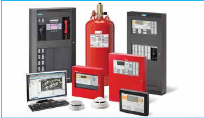
Fire Hydrant/Fire management systems and fire proof doors and fire extinguishers