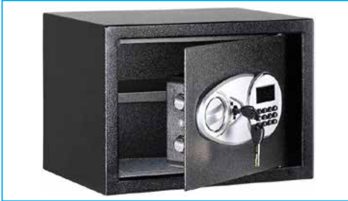
Security safes installation and lockers for financial institutions and fuel stations