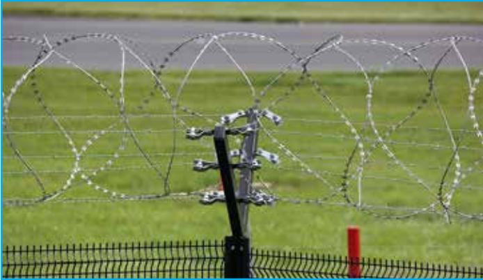
Electronic fencing. (Both Razor and pole fencing)