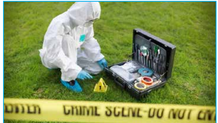
Supply & service of crime scene equipment & first aid Kits