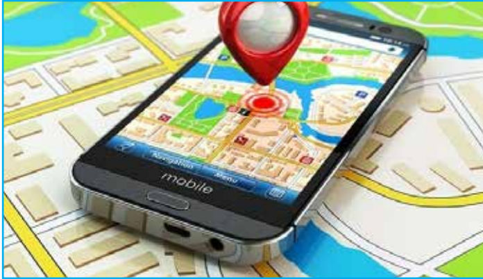
Cell Phone Tracking