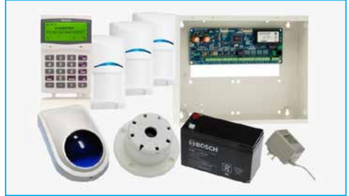
Manual/Automatic intrusion Alarm system & Response.